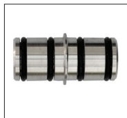
SS-RR-C Round Rail Connector