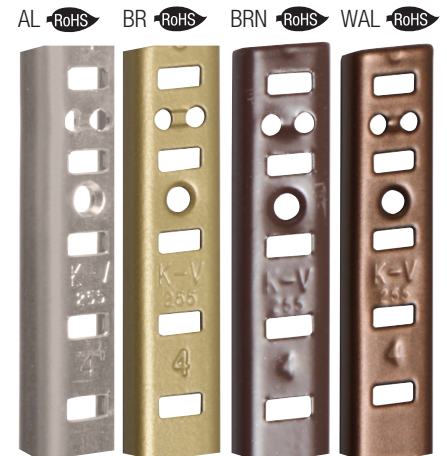
Plated finish products only

☐ Non-stock item – minimum order quantities and additional lead time may apply.