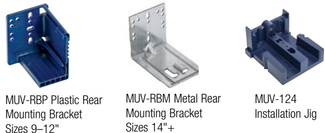
MUV-RBP Plastic Rear Mounting Bracket Sizes 9–12"