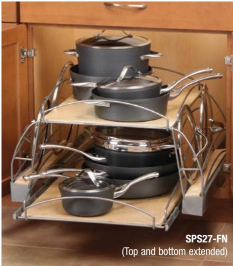
SPS27-FN (Top and bottom extended)