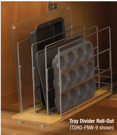
Tray Divider Roll-Out (TDRO-FNW-9 shown)