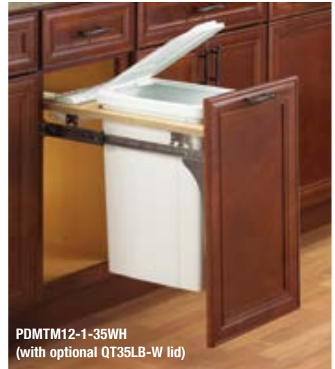
PDMTM12-1-35WH (with optional QT35LB-W lid)