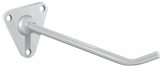
1132 Single Prong Utility Hook