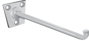
PKV3 Heavy-Duty Single Prong Utility Hook