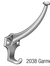
2038 Garment Hook