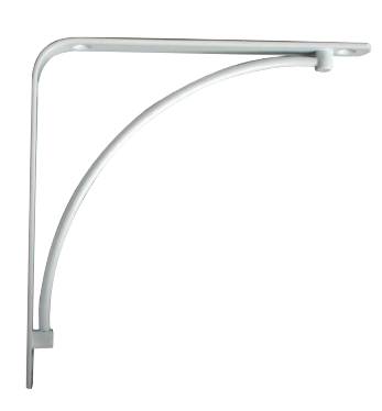
Antique Bronze (AB)