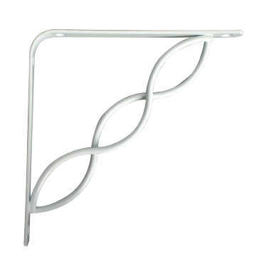
Antique Bronze (AB)