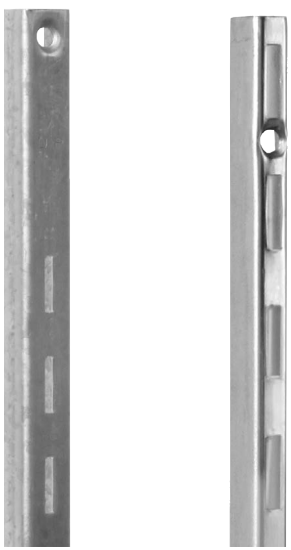
70 Series Standard