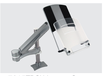
7815TDSH Laptop Support