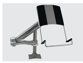
7815TSH Laptop Support