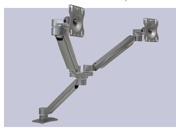
7826SHD02 (no pole)

Includes Quick Connect Adapter Bracket for each monitor support