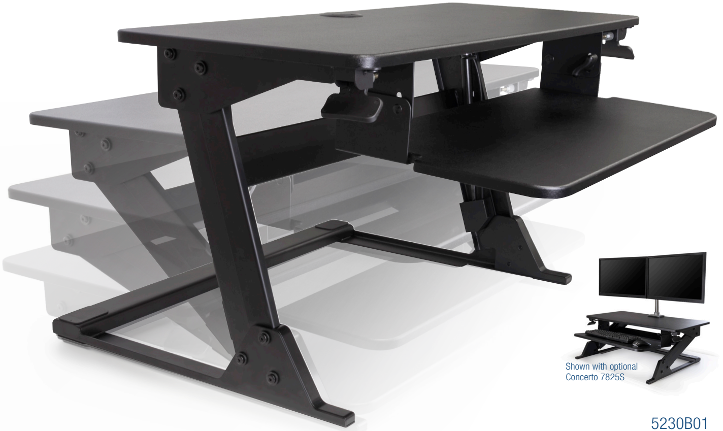
Shown with optional Concerto 7825S